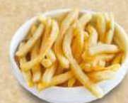
D4 French Fries