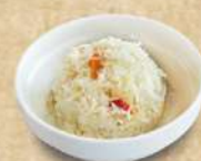
D5 Tasty Rice