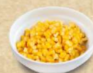
D9 Corn Niblets