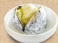
D1 Baked Potato