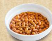
D8 BBQ Beans