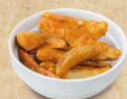
D3 Potato Wedges