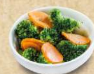
D10 Garden Veggie