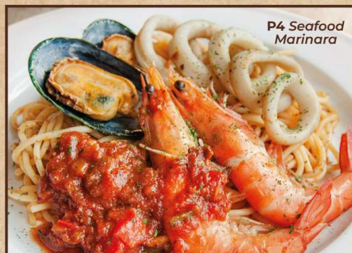
P4 Seafood Marinara