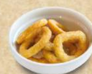
D7 Onion Rings