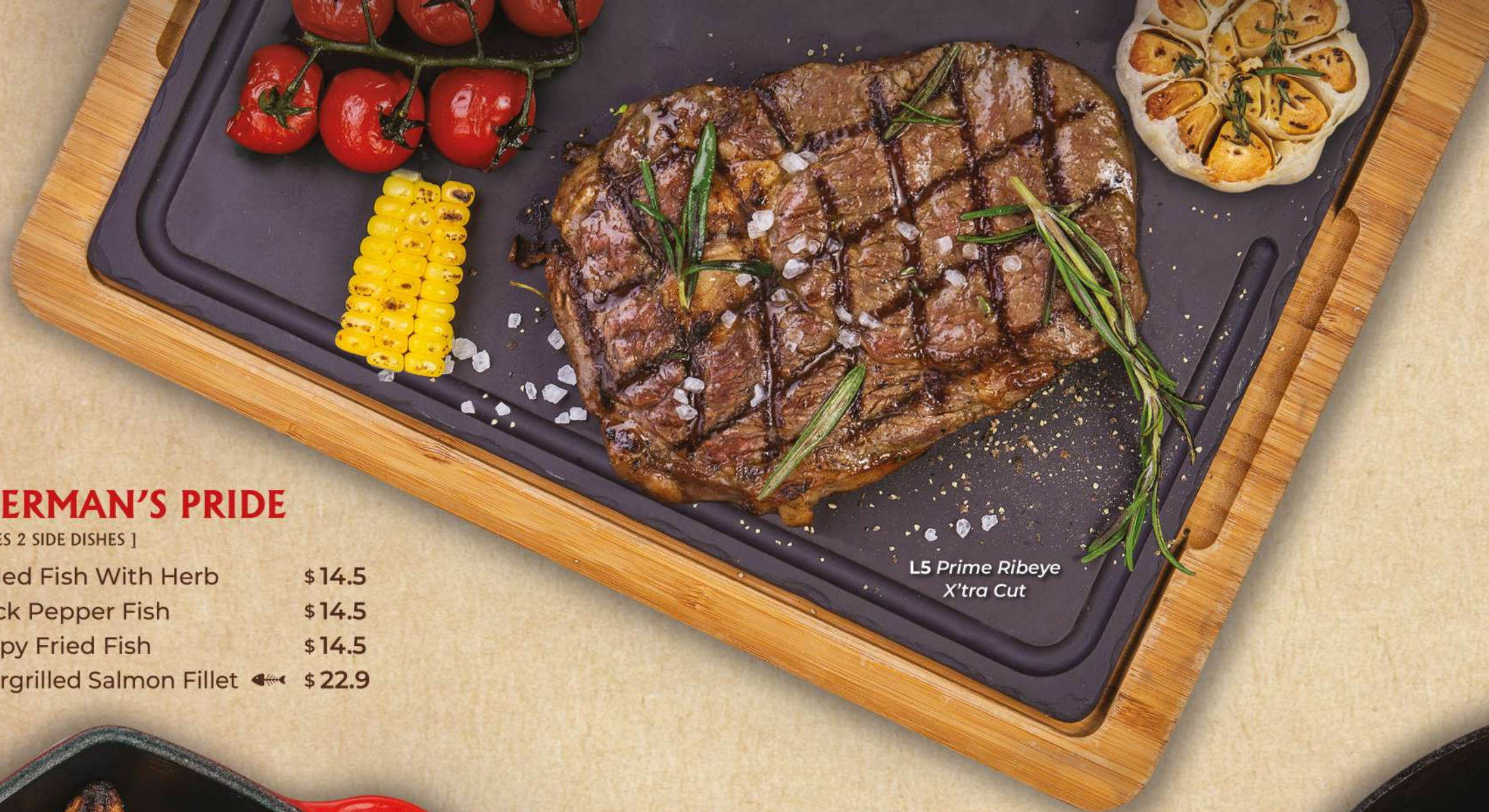
L5 Prime Ribeye X'tra Cut