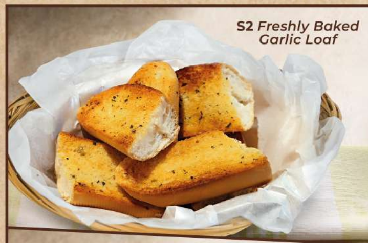
S2 Freshly Baked Garlic Loaf