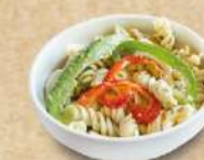
D13 Pasta Salad