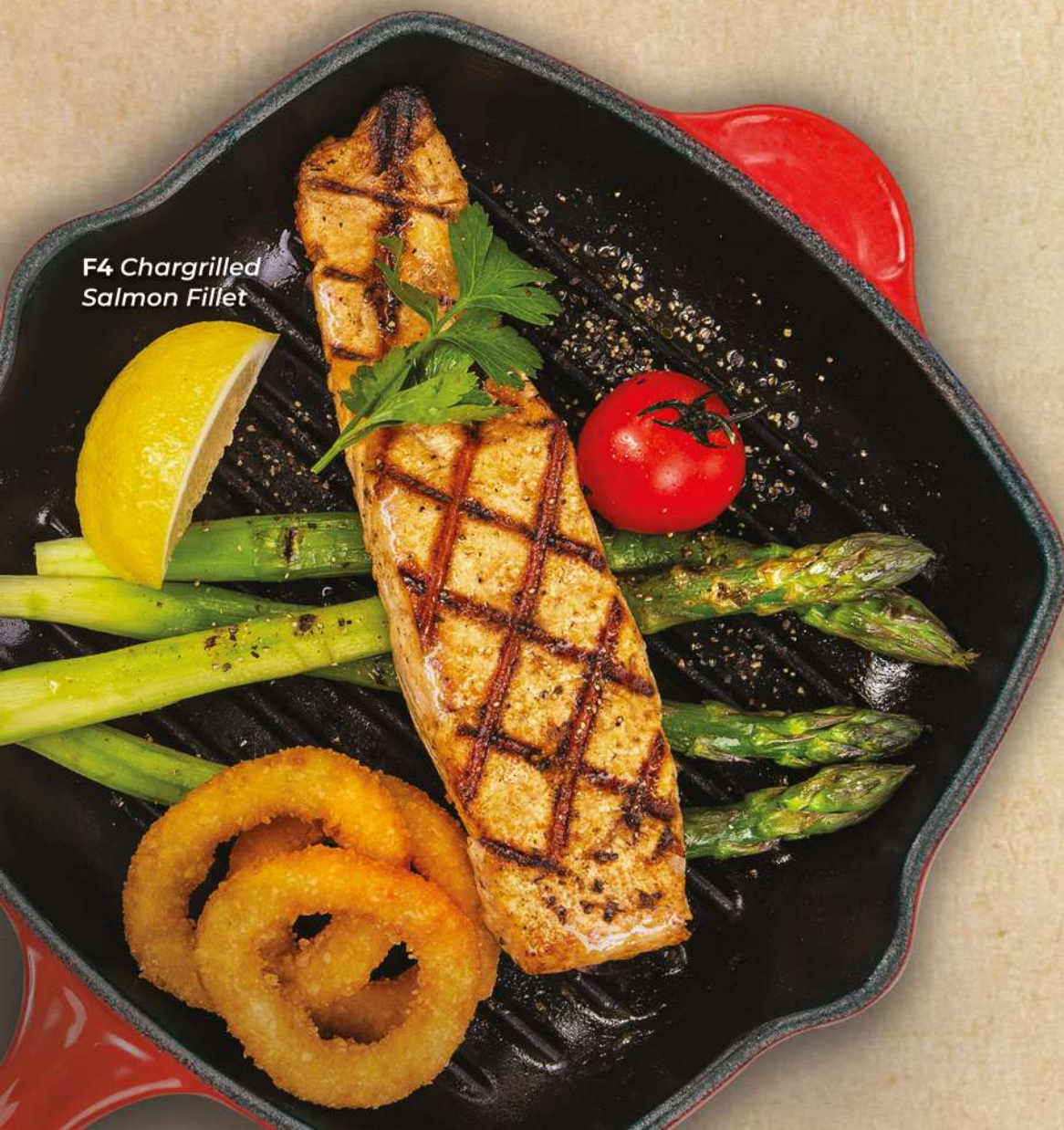
F4 Chargrilled Salmon Fillet