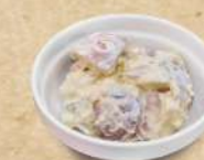
D14 Potato Salad