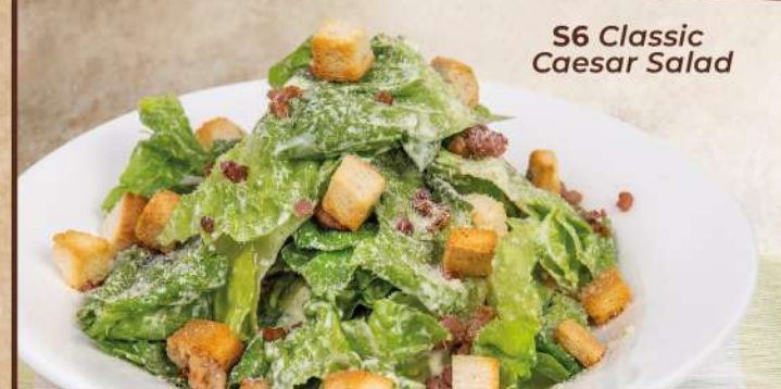
S6 Classic Caesar Salad