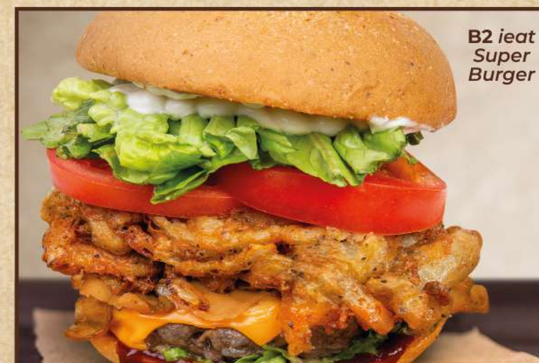
B2 ieat Super Burger