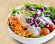
D12 House Salad