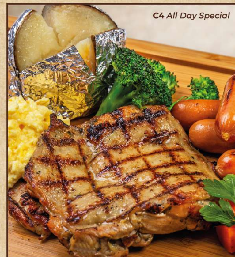
C4 All Day Special