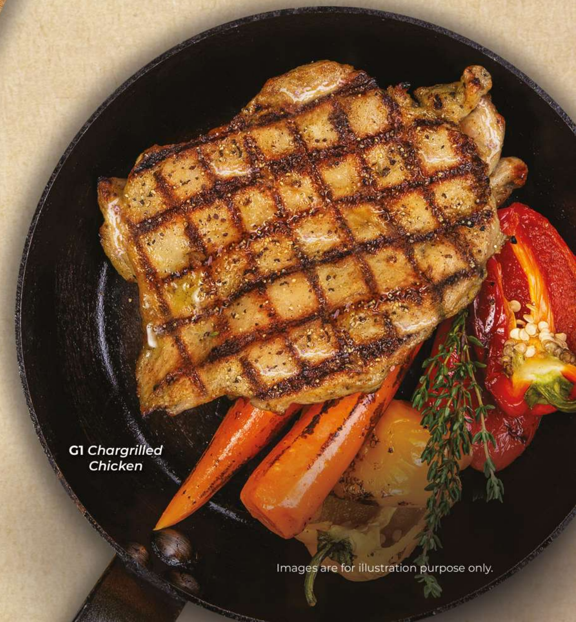
G1 Chargrilled Chicken