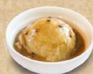
D2 Mashed Potato