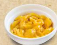
D6 Mac & Cheese